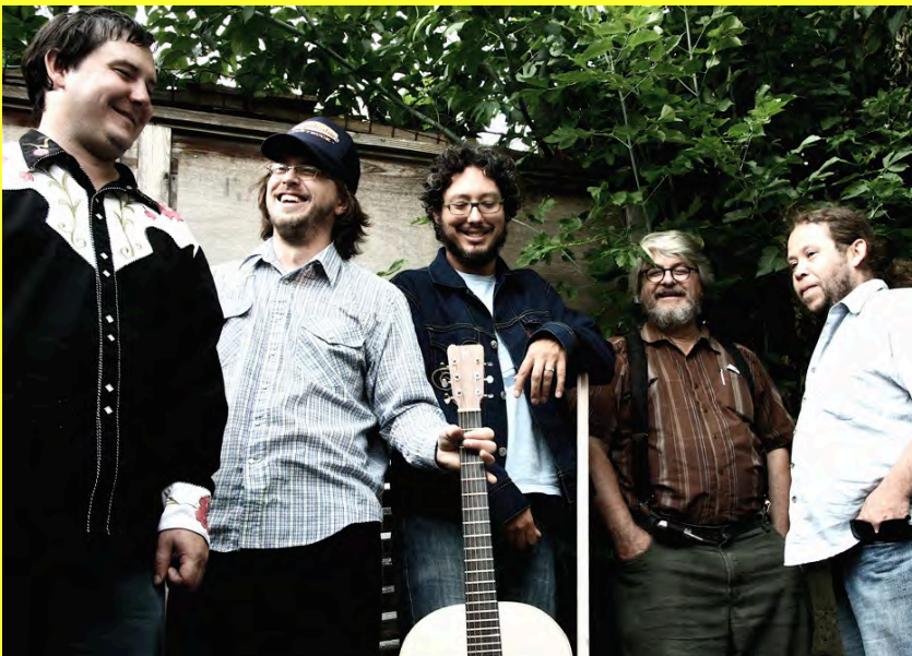
The D Rangers