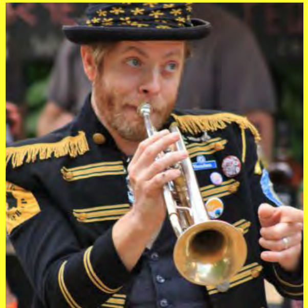
The Exile Brass Band

Founded in 1957, the John Howard Society of Manitoba works with men in conflict with the law—before, during, and after their incarceration.